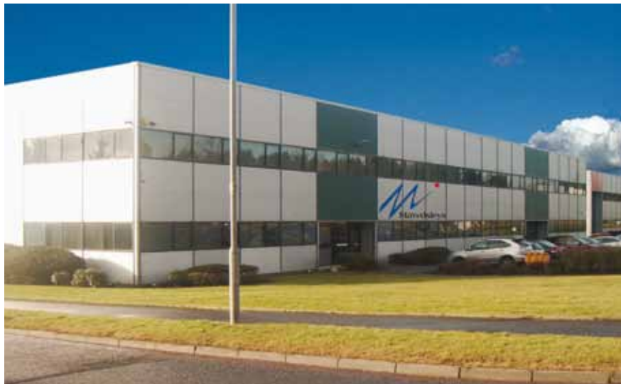
Mawdsley's East Kilbride depot

The launch of Mawdsley's new hospital services division in East Kilbride has finally introduced some long awaited competition into the market - good news for hospital pharmacies throughout Scotland.