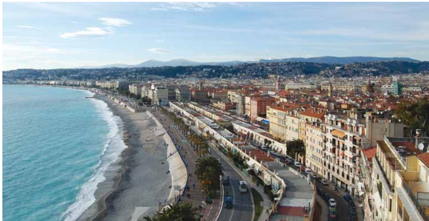
Promenade des Anglais, Nice.